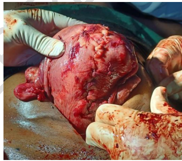
Fig. 4. Showing the repaired uterus with a grossly salvaged right uterine tube.