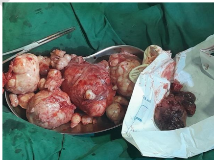
Fig. 5. Showing multiple uterine fibroid seedlings and the placenta after removal.