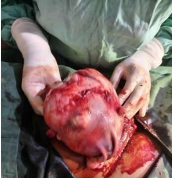
Fig. 1. Showing the uterus (full of fibroid seedlings) as it was exteriorized from the abdomen