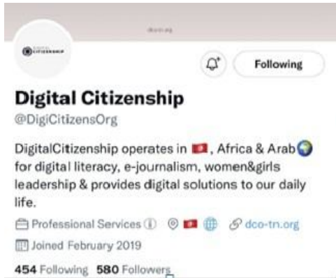
Fig.1 Key information and account data