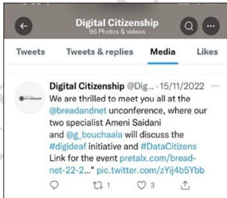
Fig.2 the latest update to the account during the study period

Fig.1 shows that this account operates in Africa & Arab World for digital Literacy-journalism, women and girls' leadership, and provides digital solutions to our daily life. It joined in February 2019. 454 following, 581 followers. It was selected for a sample study during the period from 1/8/2022 to 30/9/2022. Fig.2 shows the latest updates to the current account, 96 photos and videos, and 562 tweets about practicing digital citizenship and its values.