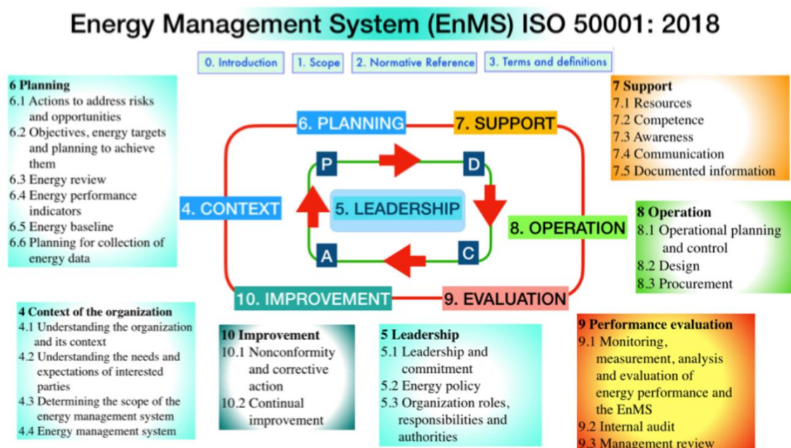
Figure 1. The PDCA diagram and the clauses in the ISO 50001:2018

As mentioned earlier, ISO 50001 is designed based on the HLS structure, so integration with other standards that are close together is possible. For example, ISO 9001 (Quality Management System), ISO 14001 (Environmental Management System), ISO 37001 (Anti-Bribery Management System), ISO 27001 (Information Security Management System) [7,19]. One thing that is important in HLS is the principle of Plan Do Check Action. Figure 1. Describe the PDCA diagram and the clauses in the ISO 50001.